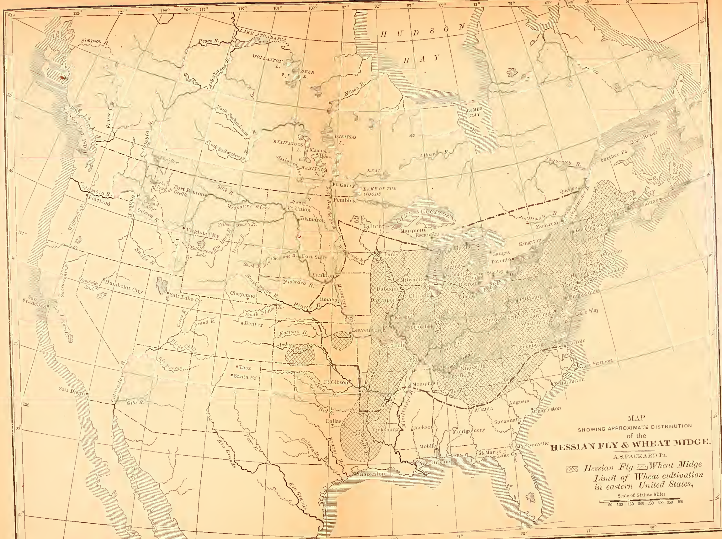
MAP SHOWING APPROXIMATE DISTRIBUTION of the HESSIAN FLY & WHEAT MIDGE.